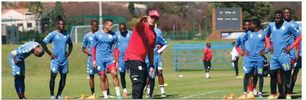
On training: Sekhukhune United FC will be relocating from the Emirates Airline Park Stadium in Johannesburg to the New Peter Mokaba Stadium in Limpopo.