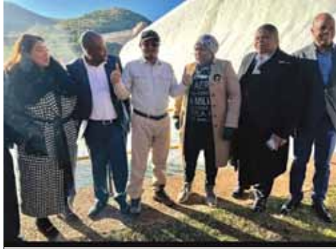
SDM Executive Mayor Cllr Julia Mathebe, Acting Premier of Limpopo Province Basikopo Makamu, DWS Minister Senzo Mchunu, Mpumalanga Premier Refilwe Mtshweni-Tsipane, Deputy Minister of DWS David Mahlobo and THLM Executive Mayor Cllr Lesetja Dikgale during their assessment at the Loskop Dam.

Minister of Water and Sanitation, Senzo Mchunu, announced that his department has allocated R1.1 Billion for the implementation of the Loskop Dam Water Supply Project. The project is set to benefit villagers from Elias Motsoaledi Local Municipality in Sekhukhune